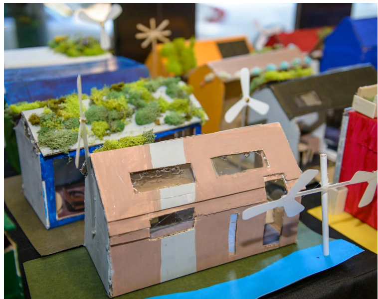
Structures with eco-friendly design features