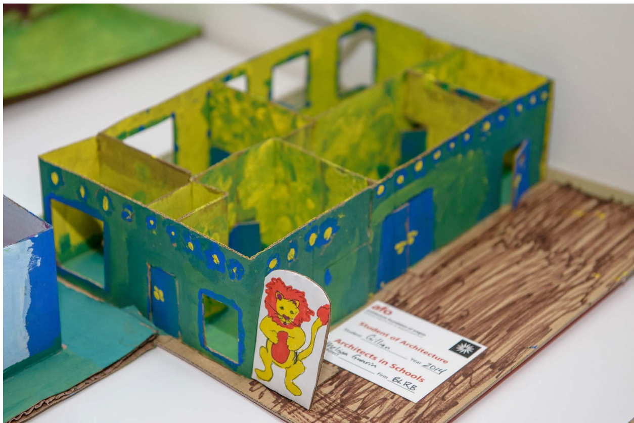
A structure for a special client who is a lion