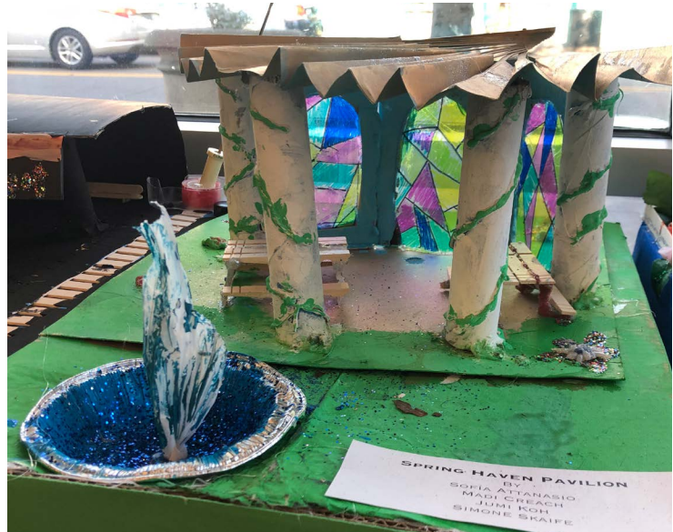
An outdoor pavilion and fountain design