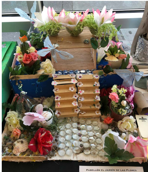
An outdoor flower garden