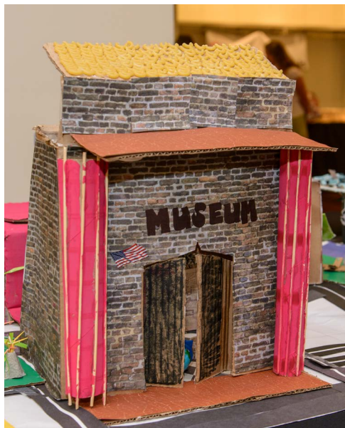
A museum facade